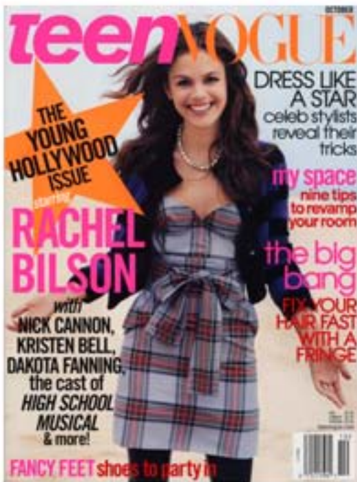
Teen Vogue Oct. 2006