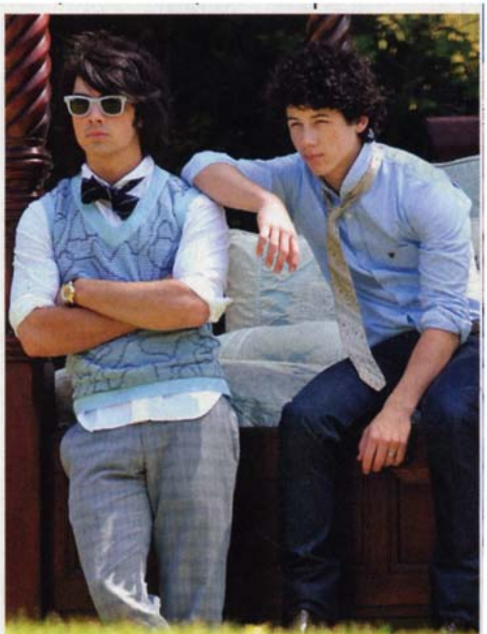
Hey, hey, it's the Jonas Brothers! JOE (left) and NICK JONAS posed on a four-poster bed for a Monkees-esque style shoot in L.A. March 26.