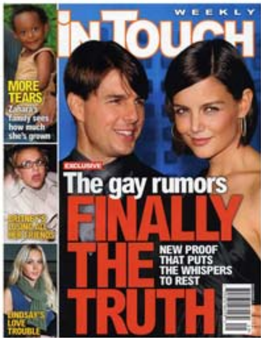
InTouch dec 2007