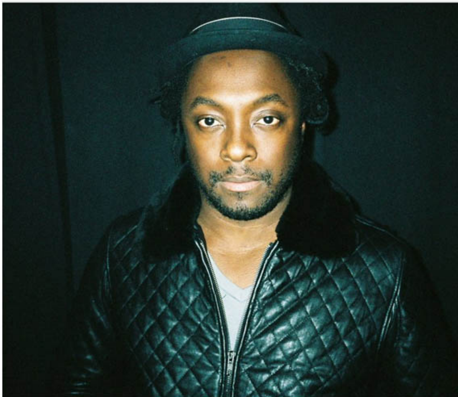
WILL I AM CORPUS LEATHER BOMBER