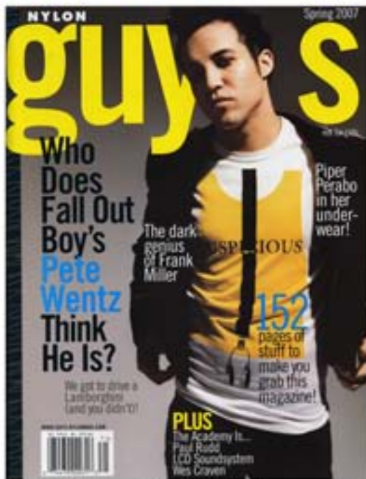
NYLON guys Spring 2007