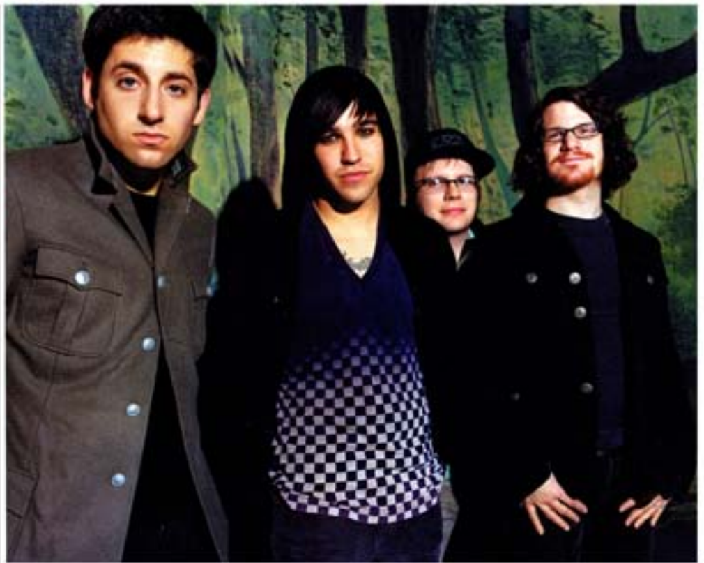
fall out boy