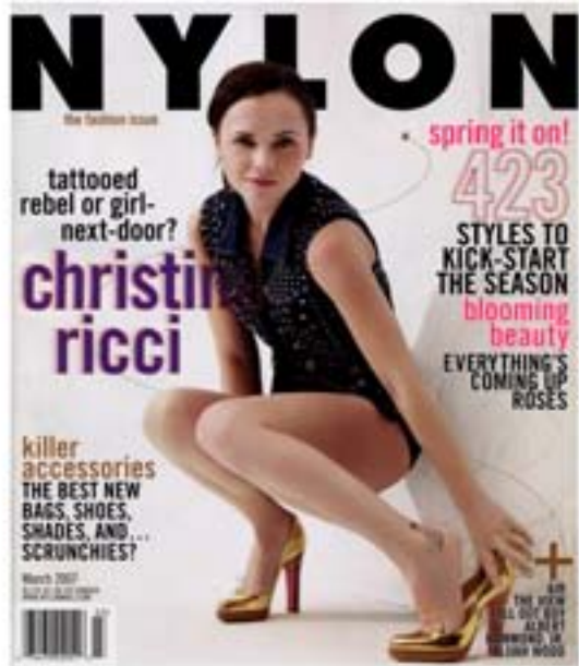
NYLON Mar 2007