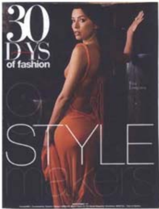
Hearst Fashion 2006