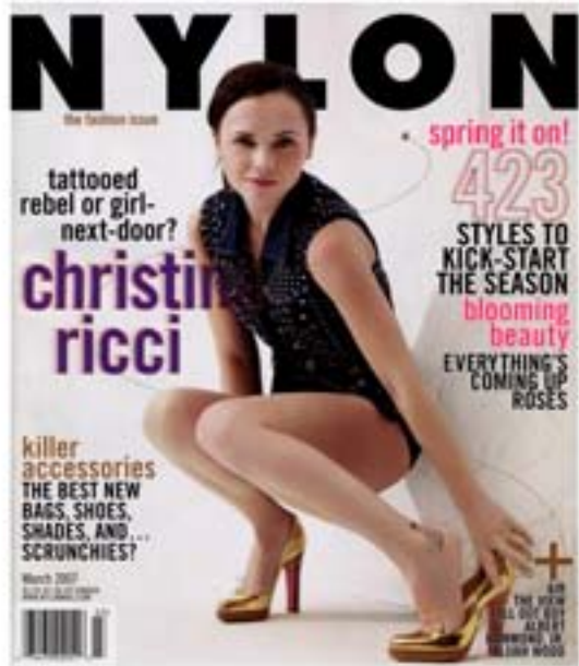
NYLON Mar 2007