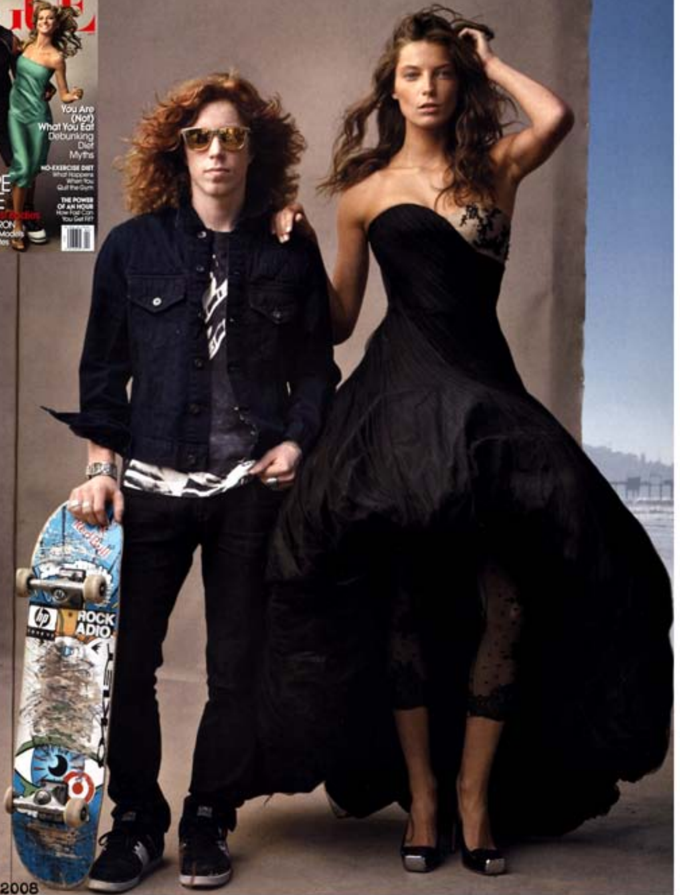
VOGUE APR 2008 Shaun White Corpus Jckt